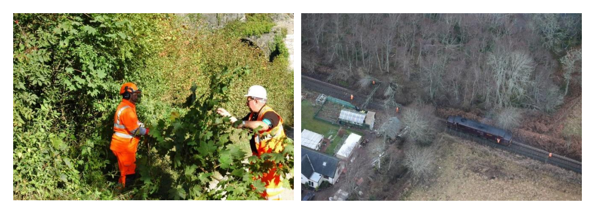
Figure 2.2. The current process in vegetation management

The current process is performed purely manually and the current inspection regime for lineside assets both is ineffective and inherently unsafe. Workers are expected to negotiate slopes, barriers, unstable ground, hidden hazards and poor lighting to carry out visual and tactile inspections.