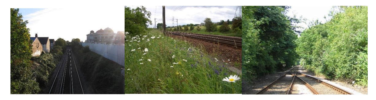
Figure 2.1. Some views from the railways showing the vegetation

Millions of trees of different kinds together with smaller plants are growing along the railway and managing vegetation is hugely important for the safe running operation of railways. If it is not managed well, encroachment of vegetation and even fallen leaves may pose a risk to the safe running of the railway and cause delays or accidents. In the UK, incidents caused by vegetation can cost the railway upward of £100 million in 2017^3 . The management of the lineside principally deals with: i) the management of vegetation along the railway and within the boundary to reduce or avoid risk to the railway and ii) assuring that a boundary is provided to both satisfy legal requirements and prevent trespass or incursion. The system needs to work within current legislation and best practices regarding health and safety. Where herbicides are to be applied the system should comply with current legislation and guidance on their application.