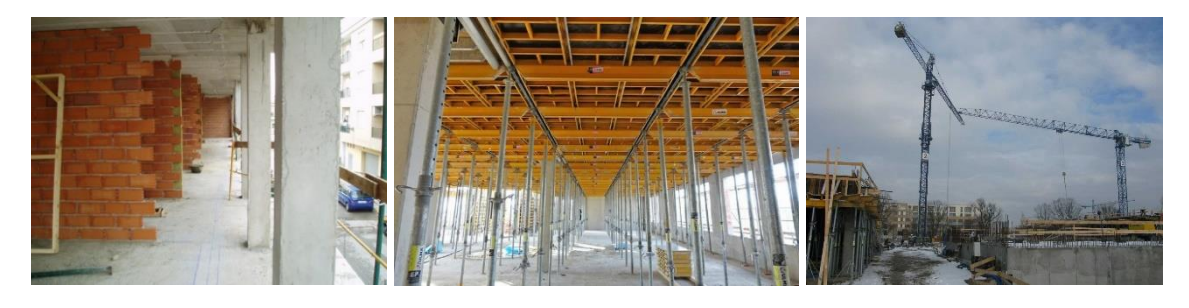
Figure 1.1. Working environment examples<sup>1,2</sup>

In construction, the working environment fluctuates often as the infrastructure or building construction progresses: new elements appear, others disappear, the infrastructure grows vertically, horizontally... The size of the facility can vary between hundreds to several thousands of square meters. Most of the activities are performed manually by workers, assisted by hand tools. In their day-to-day activity, workers have to move tools and other elements (such as material needed for construction, for instance sacks and drums) from one side to another using wheelbarrows, forklifts or cranes and manipulate heavy tools. These activities can be the source of ergonomic problems. Figure 1.1 is included for the sake of illustration, no corresponding to the reference construction environment that will be available for testing.